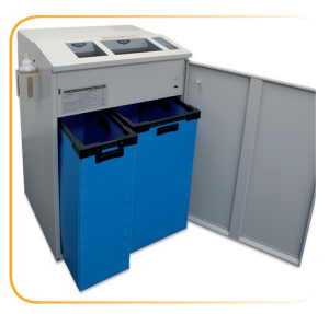
Separate Waste Bins for Paper and CDs