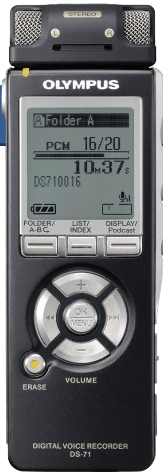
Digital Voice Recorder DS-71