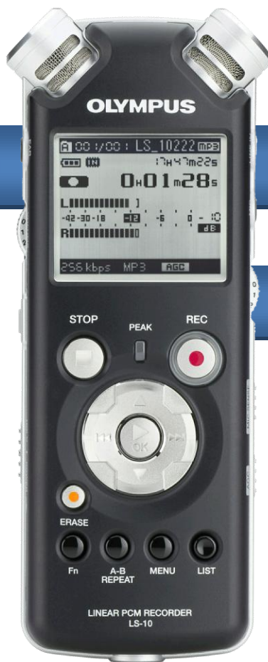
Liner PCM Recorder LS-10